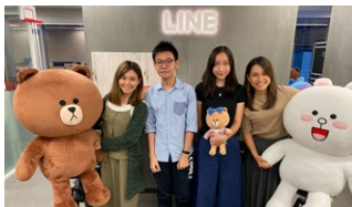
工作體驗 Job Shadowing