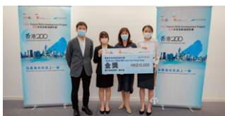
社創提案 Project for Hong Kong Pitching