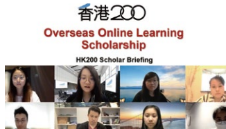
海外線上學習獎學金 Overseas Online Learning Scholarship