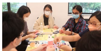
技能實驗室 Skill Labs