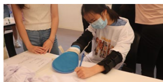
社會體驗 Social Experience