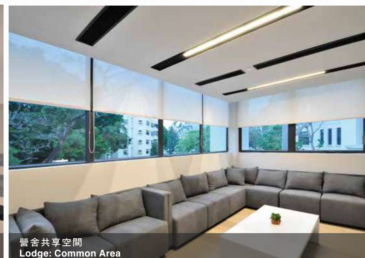
營舍共享空間 Lodge: Common Area