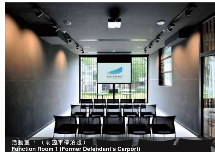
活動室 1（前囚車停泊處） Function Room 1 (Former Defendant's Carport)