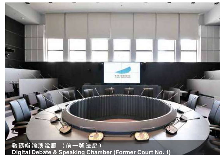
數碼辯論演說廳（前一號法庭） Digital Debate & Speaking Chamber (Former Court No. 1)

In addition, a brand-new two-storey Lodge offers a wide range of training camps, including leadership training, life experiences, and adventure-based activities. The Lodge can accommodate 85 local and visiting scholars and participants, providing opportunities for participants to develop closer ties and cross-cultural competence as they live, work and study together.