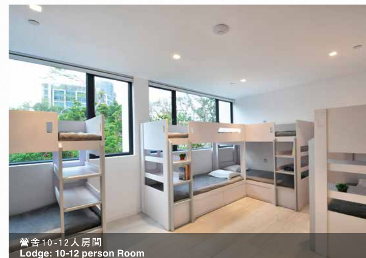
營舍10-12人房間 Lodge: 10-12 person Room