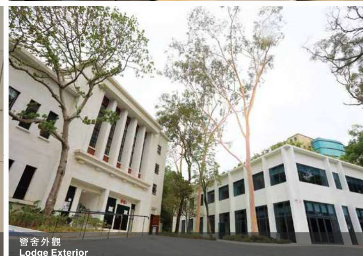
營舍外觀 Lodge Exterior