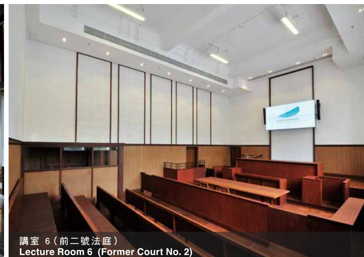
講室 6（前二號法庭） Lecture Room 6 (Former Court No. 2)