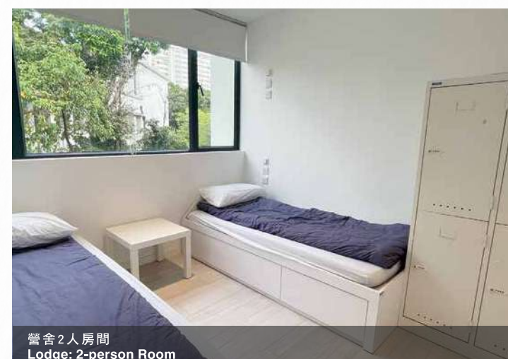
營舍2人房間 Lodge: 2-person Room